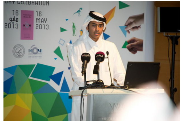
Qatar: Museum Direction