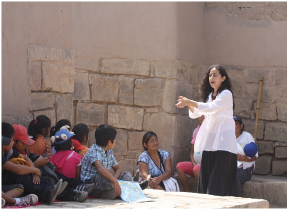
Perou: Pachacamac Museum

ICOM encourages exchanges between past and contemporary generations through the promotion of museum activities. These institutions, instigators of development and engines of democracy, education and training , also serve as witnesses of the past and guardians of humanity's treasures for future generations.